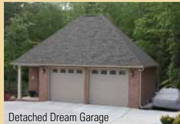
Detached Dream Garage