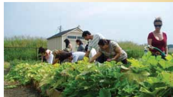
Rotary Community Garden