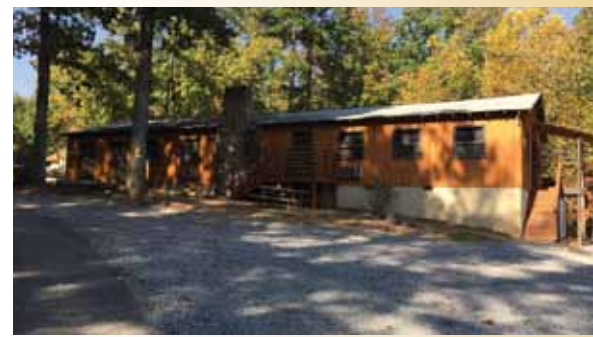
Camp Crowders Ridge