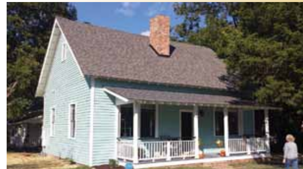
Loray Village Project