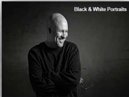
Black & White Portraits