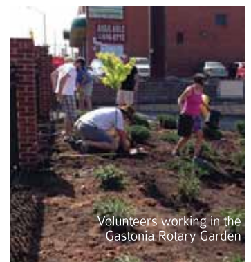
Volunteers working in the Gastonia Rotary Garden

Those are just the basics. Without those, a community garden doesn't have much of a chance to succeed. That's why it's amazing to see many of the community gardens thriving in our area. And what's even more amazing about it all, is that they each have their own distinct personality.