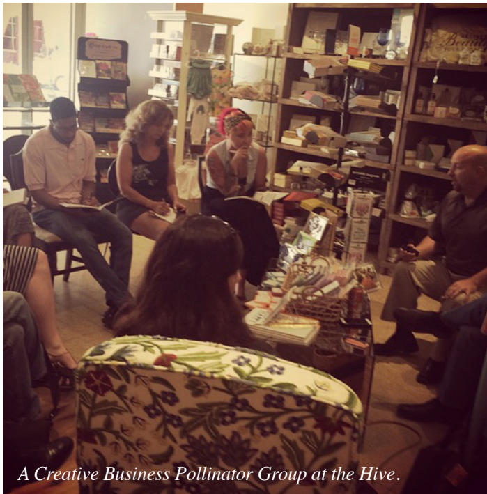
A Creative Business Pollinator Group at the Hive.

designing jewelry, filmmaking, photographing, playing music, and sculpting.