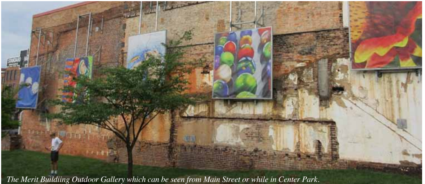
The Merit Building Outdoor Gallery which can be seen from Main Street or while in Center Park.