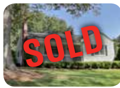
Charming! Beautiful lot! Hardwood floors! $155,000