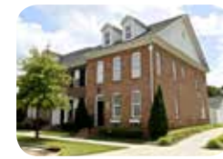
Walk to DT Belmont! N'hood pool! $199,900