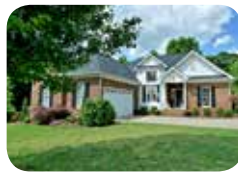
Open plan! Large master suite! $200,000