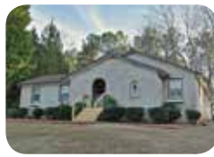
Open living area! Large yard! $180,000