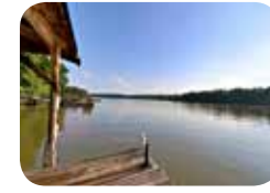
Waterfront! 2 kitchens! $350,000