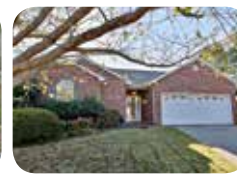
Downsizing? Rare Gastonia patio home! $169,900