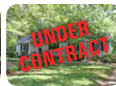
Vaulted great room! Lovely, level yard! $109,900