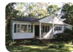
So close to DT Mt Holly! Basement! $140,000