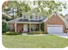
Spacious, bright, wood floors! $265,000