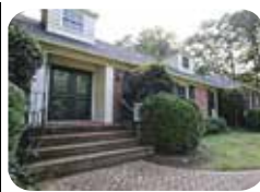
Armstrong Cir! Updated kitch & BA! $365,000