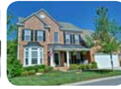
Belmont! 4BR+5th/bonus! Beautiful and open! $304,900