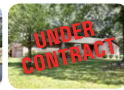
Brick ranch on 3+ acres with shop! $155,000