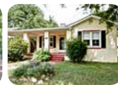
Beautiful bungalow in Mount Holly! $69,900