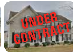
Open & spacious in Belmont! $241,000