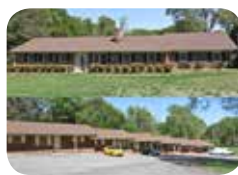
Belmont Abbey area investment! House & 6 apartments! $475,000