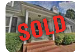
Updated! Fresh! Spacious! $244,900