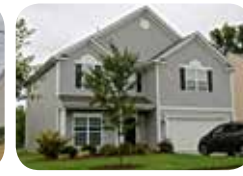
So much space! Neighborhood pool! $210,000