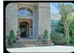
Misty Waters! WATERFRONT with dock & INDOOR pool! Outdoor living areas! High tech! $1,275,000