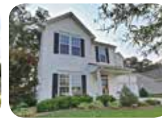
Potters Barn feeling! Beautiful throughout! $189,900