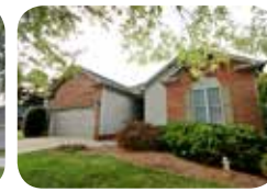
Open & Vaulted! Shop/Garage! 0.7 acres! $189,900