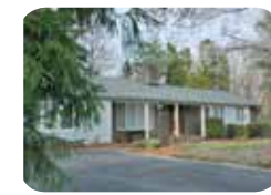
Great ranch! Tons of space in & out! $170,000