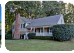
Hardwoods! Tons of space! Convenient! $269,900