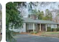
Great ranch! Tons of space in & out! $174,500