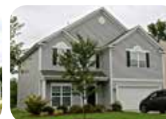
So much space! Neighborhood pool! $210,000