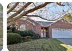
Downsizing? Rare Gastonia patio home! $169,900