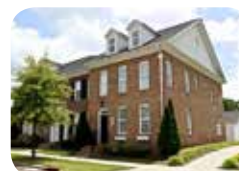
Walk to DT Belmont! N'hood pool! $215,000