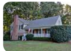
Hardwoods! Tons of space! Convenient! $269,900