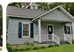
Close to town! Great home! $75,000