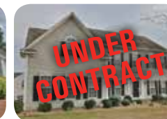
Open & spacious in Belmont! $241,000