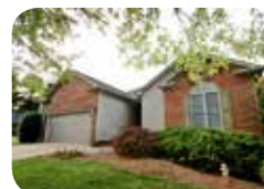
Open & Vaulted! Shop/Garage! 0.7 acres! $189,900