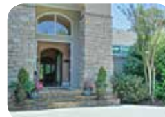
WATERFRONT with dock & INDOOR pool! High tech! $1,275,000