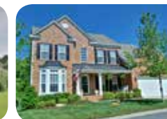
Belmont! 4BR+5th/bonus! Beautiful and open! $304,900