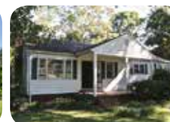
So close to DT Mt Holly! Basement! $140,000