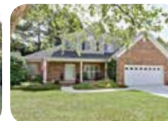
Spacious, bright, wood floors! $265,000