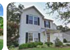
Pottery Barn feeling! Beautiful throughout! $189,900