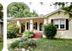
Beautiful bungalow in Mount Holly! $69,900