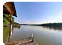
Waterfront! 2 kitchens! $350,000