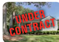
Charming! Beautiful lot! Hardwood floors! $155,000