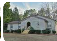
Open living area! Large yard! $180,000