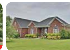
Vaulted & spacious! Large, level yard! $345,000