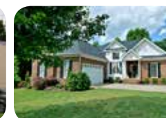
Open plan! Large master suite! $200,000