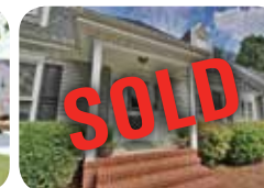
Updated! Fresh! Spacious! $244,900