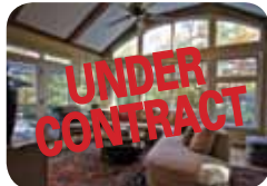
Country Club area w/ abundant features! $350,000