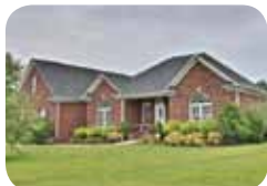
Well-appointed! Grand! $350,000