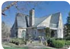
Mt Holly landmark! Convenience AND Privacy! $230,000