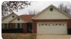
Great house, must see! RANCH, new paint and carpet, hardwoods in foyer, partially fenced back yard, storage building. Motivated seller! $195,000. CALL PENNY!