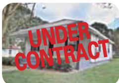
Like new! Stop renting! $85,000