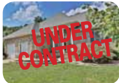
Immaculate and spacious! $179,900