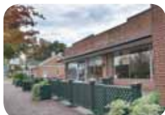
DT Mt Holly restaurant, bonus space, parking! $895,000