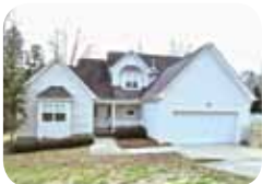
Deerfield! 4 BR! Vaulted great rm! $165,000