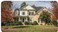
Open floor plan with 2 story family room. This home is absolutely gorgeous! 4 BR plus a bonus room that could be another bedroom! $298,500. CALL WENDY