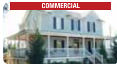
Great Commercial Office Suite in Historical Mount Holly. It's on 2nd floor & has 3 rooms, hallway and bath available for rent. Office space, $875/mo. + utilities. CALL CHIP!