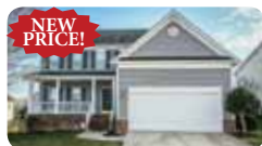
Beautiful home that's ready to move in! No detail spared! Fantastic location! Short drive to downtowns of Belmont and Mount Holly. $206,900. CALL CHIP!