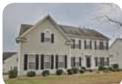
Open & spacious in Belmont! $250,000