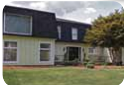
Waterfront! Dock under deck! $499,000