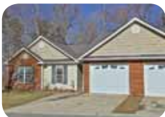
Patio home in Mt Holly! Open! Spacious! $130,000