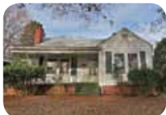
2 houses with tons of charm for $99,900!