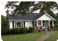
Mount Holly Business zoned! High visibility! $119,900