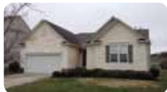
This cute 3BD/2BA home will not last long! New paint and new carpet! A must see! $174,900. CALL PENNY!