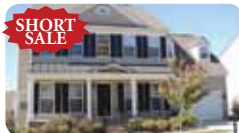
Breathtaking 4 BR/3BA home in Belmont South Ridge Subdivision $265,000. CALL WENDY