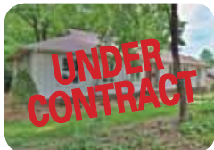
Crisp! Fresh! Updated! $159,900