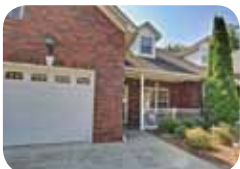
Mt Holly Townhome! So convenient! $139,900