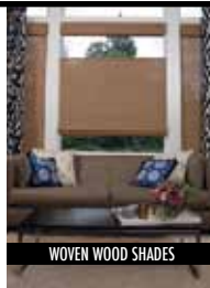
WOVEN WOOD SHADES

All popular Budget Blinds window coverings can be motorized by Somfy®