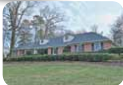
Armstrong Cir.! Updated kitch. & BA! $378,000