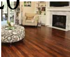
20 FLOORING MADE SIMPLE