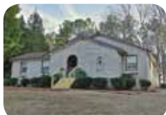
Open living area! Large yard! $180,000