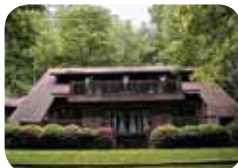
Belmont! Acreage! Truly unique! $284,000