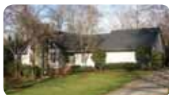
Close to Main St. Belmont. Impeccable property in quiet Belwood! Home has been thoughtfully maintained and improved. No city taxes! 3 BR/2BA, 1/2 acre. $295,000. CALL JENNY!