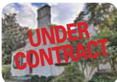
Charming! Attic + basement! $79,900