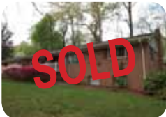
Woodland Park! Basement! $159,500