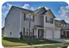
Open living up and down! $155,000