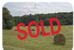
27 ac! Bring a horse! $127,500