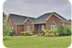
Well-appointed! Grand! $350,000