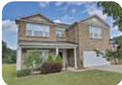
Living space galore! Fresh! $225,000