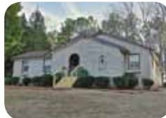
Open living area! Large yard! $180,000