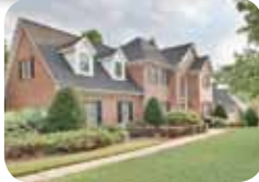
Glenmoor! Updated! 4BR+Bonus! $359,900