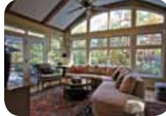
Country Club area w/ abundant features! $350,000