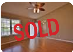
3-4 bedrooms! Convenient to I-85! $139,900