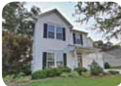
Pottery Barn feeling! Beautiful throughout! $198,500