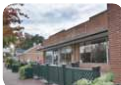
DT Mt Holly restaurant, bonus space, parking! $895,000