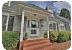
Updated! Fresh! Spacious! $259,900