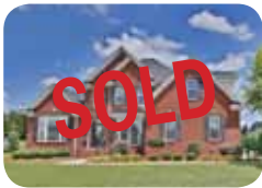
Grand & Open! $315,000