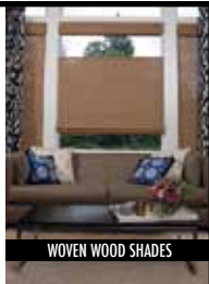
WOVEN WOOD SHADES

All popular Budget Blinds window coverings can be motorized by Somfy®