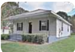
Like new! Stop renting! $85,000