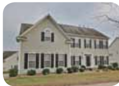
Open & spacious in Belmont! $265,000