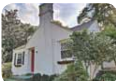
Charming! Attic + basement! $79,900