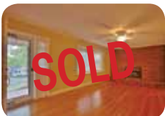
2 master suites! 2 living areas! $154,900