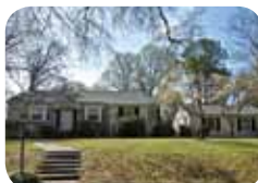
Armstrong Circle! Large lot! Hardwood floors! $110,000