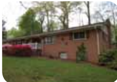
Woodland Park! Basement! $159,500