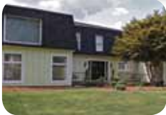
Waterfront! Dock under deck! $499,000