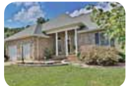
Immaculate and spacious! $179,900