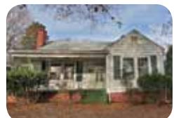
2 houses with tons of charm for $99,900!