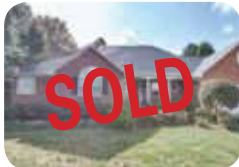
Deerfield with pool! Great plan! $170,000