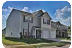
Open living up and down! $155,000