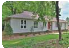
Crisp! Fresh! Updated! $159,900