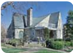
Mt Holly landmark! Convenience AND Privacy! $290,000