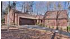
Mountain-like retreat! Vaulted great rm! Off Kendrick! $219,900