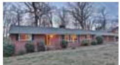
4 BR ranch! Hardwoods! 2 fireplaces! Basement! Granite! $249,900