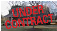
Screened porch! Large yard! 3 BR! $157,500