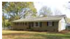
Belmont ranch easy walk to downtown. Priced to move at $145,000