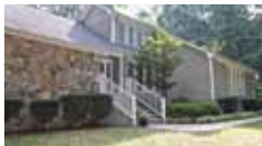
Convenient AND private! Enjoy nature from every room! Vaulted! $259,900