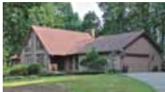
Stanley! Vaulted great rm! Granite in kitchen! Spacious! $249,900