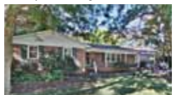
So much space! Bonus room! Hardwoods! $134,500