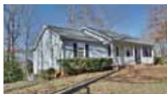
Open, vaulted! Great plan! Charming! $139,900