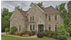
Glenmoor: Everything! Large lot! Huge unfinished basement! 5BR! $479,000