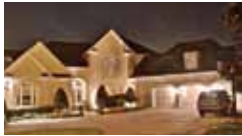
Breathtaking view! Resort living at home! Spacious! $750,000