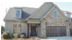
Custom built 4BR, 2.5BA condo at Village at the Mountain $239,500