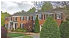
MOTIVATED SELLER! Huge bonus or media! 5BR! Vaulted sunroom! Private yard! $329,900