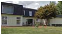
Waterfront! Docks UNDER deck! 2nd Living Qtrs! $529,900