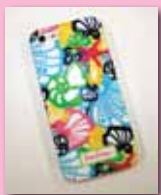
Lilly Pulitzer iPhone Case

Come See Our Beautiful New Lilly Pulitzer Selection!