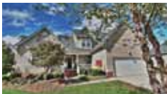
Deerfield! Open! Sunroom! Master down! $198,500