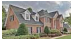
Elegant brick! Open living! 4BR+bonus! $359,900