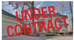
Over an acre! Man cave! 2 living areas! Updated kitchen! $289,900