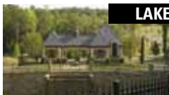
Reflection Pointe 1024 Hartshaw waterfront lot $158,022 Buy this lot and get 1021 Hartshaw FREE