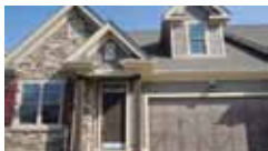
Custom built 3BR, 2.5BA off Union Rd $224,000