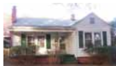
Walk to Belmont's main street from this vintage charmer 2 BR, 1BA with addition 1 BR, 1BA apartment $117,000 CALL JENNY