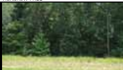
Laurel Woods & Crowders Woods Subdivision 24 lots at $8,000 each or purchase bundle for $140,000