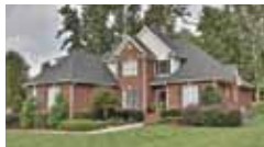
WOW! Immaculate! Open and bright! Vaulted! 2 BR down! Chef's kitchen! $325,000