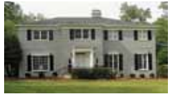
Chef's kitchen! 5 BR! Hardwoods! Master down! Huge lot! $570,000