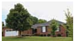
Spacious! Vaulted w/fireplace! Great yard & living area! $179,900