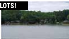
3+ acres waterfront with long range channel views $265,200