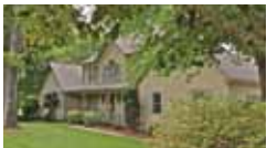
4 BR! Huge sunroom! Pool & outdoor living! 2 masters! $259,900