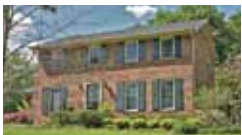
Off Kendrick Rd! 2 acres with pool! Immaculate! $228,500