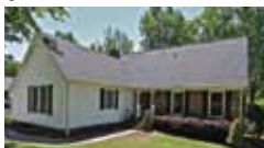
Great yard! Great living! Master down! 2 living areas! $145,000