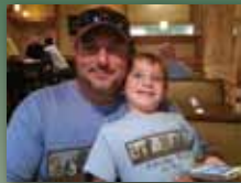
Jim Thompson & Son 704-879-4384