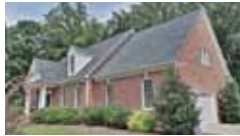
Country Club! 3 levels! Over 5000 sq ft! Only 5 years old – built for owner! $575,000