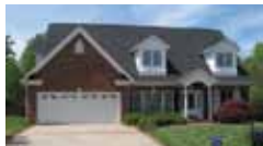
High end details! Master on main $298,500