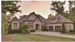
Fabulous lake views with French elegance! Outdoor living! Expansion room! $749,900