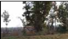
17+ acres Archie Whitesides Road, Gastonia $149,000