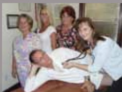
Belmont Chiropractic Staff

Personal Injury/Auto Accident Cases Workman's Compensation Sports Injury Children's Chiropractic Care Most Insurance Accepted