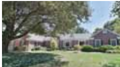
3BR+Bonus! Storage! Amazing Workshop! $399,900