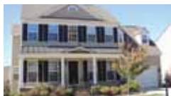
Breathtaking 4 BR/3BA home in Belmont South Ridge Subdivision $289,000