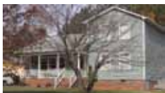
Country setting at it's best. Spacious rooms Remodeled kitchen/master bath $134,500