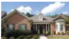
Highly sought after ranch near Gastonia Country Club $295,000