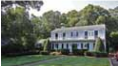
Amazing yard! Great closets! Balcony! 4 BR! $340,000