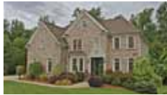
Glennmor: Everything! Large lot! Huge unfinished basement! 5BR! $479,000