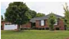
Spacious! Vaulted w/fireplace! Great yard & living area! $189,900