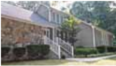
Convenient AND private! Enjoy nature from every room! Vaulted! $259,900