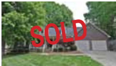
Enjoy the backyard from screened porch! 4BR! $227,500