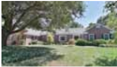
3BR+Bonus! Storage! Amazing Workshop! $399,900