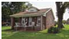
1.8 ac! 3 BR! Enjoy the space and charm! 3 bedrooms! Easy drive to CLT! $149,900