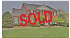
Walk to GCC! Private backyard! 5BR! $449,900