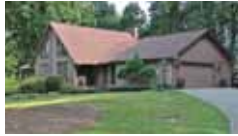
Stanley! Vaulted great rm! Granite in kitchen! Spacious! $249,900