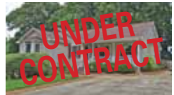
Vaulted! Open! Amazing! 3BR! Updated! $129,900