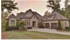
Fabulous lake views with French elegance! Outdoor living! Expansion room! $749,900