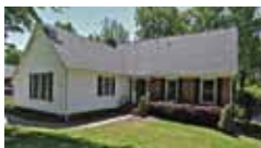
Great yard! Great living! Master down! 2 living areas! $145,000