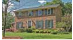
Off Kendrick Rd! 2 acres with pool! Immaculate! $228,500