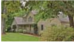
4 Bedrooms! Huge sunroom! Pool and outdoor living areas! $279,900