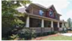
NC Healthy Built Home! Energy Star & 5 Star- rated! Live Healthy! Pool! 4BR+Bonus! $585,000