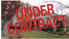
Executive 5 BR! St. Andrews $550,000