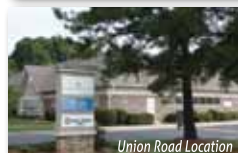
Union Road Location