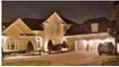
Breathtaking view! Resort living at home! Spacious! $750,000