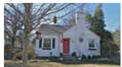
Charming! Hardwoods! Attic to expand! $84,900