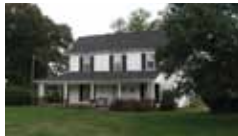
Vintage! Approx. 6ac! 3BR! Potential 2nd living qtrs.! $229,900