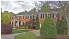
So much space! Huge bonus or media! 5BR! Vaulted sunroom! Private yard! $349,900