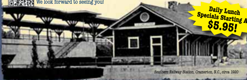
Southern Railway Station, Cramerton, N.C., circa 1920

*Cannot be combined with any other offer. Dine-in only. †One free kids meal with each adult entree purchase. 10 and under. Cannot be combined with any other offer. Dine-in only.