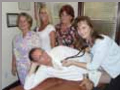
Belmont Chiropractic Staff

Personal Injury/Auto Accident Cases Workman's Compensation Sports Injury Children's Chiropractic Care Most Insurance Accepted