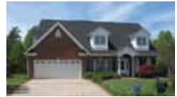
High end details! Master on main $298,500