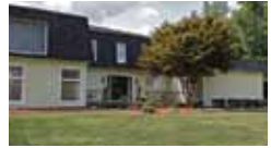
Waterfront! Docks UNDER deck! 2nd Living Qtrs! $569,900