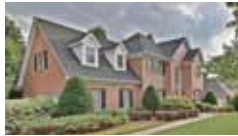
Elegant brick! Open living! 4BR+bonus! $359,900