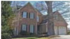
Stately Colony Woods! $179,900