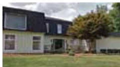
Waterfront! Docks UNDER deck! 2nd Living Qtrs! $569,900