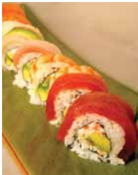
SUSHI MADE FRESH DAILY!