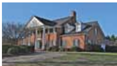
Live large! 5BR! 2 Bonus rms! Walk to GCC! $579,900!