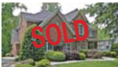
Cramer Mtn! 4 BR! Open and spacious! $399,900