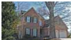
Stately Colony Woods! $179,900