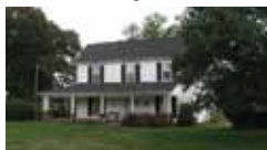
Vintage! 2nd Liv Qtrs! $179,900