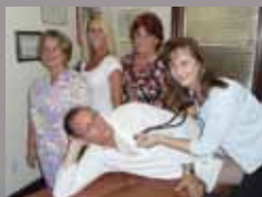
Belmont Chiropractic Staff

Personal Injury/Auto Accident Cases Workman's Compensation Sports Injury Children's Chiropractic Care Most Insurance Accepted