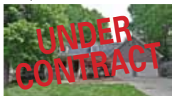
Enjoy the backyard from screened porch! 4BR! $227,500