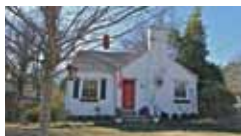
Charming! Hardwoods! Attic to expand! $89,900