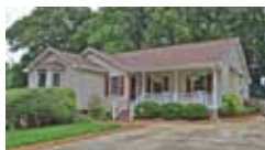
Vaulted! Open! Amazing! 3BR! Updated! $129,900