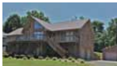
Overlooks beautiful lake! Ultimate retreat- everyday feels like vacation! $375,000