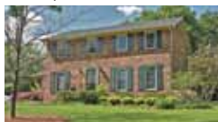
Off Kendrick Rd! Over 1 acre with pool! Immaculate! $249,900