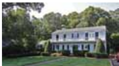
Amazing yard! Great closets! Balcony! 4 BR! $340,000