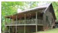
1.8 acres! Rustic Charm! $169,500