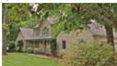
4 Bedrooms! Huge sunroom! Pool and outdoor living areas! $295,000