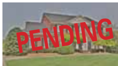
Walk to GCC! Private backyard! 5BR! $449,900