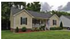
Mount Holly! Vaulted! 3 BR! Deck and porch! $114,900