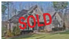
Misty Waters! Deeded boat slip! Over 5000 sq ft! $774,900