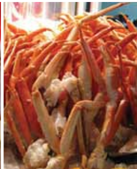
SNOW CRAB LEGS!