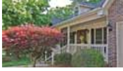
Enjoy the backyard from screened porch! 4BR! $227,500