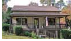
Abundant Charm! $139,900