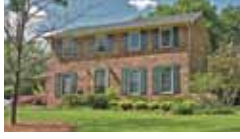
Off Kendrick Rd! Over 1 acre with pool! Immaculate! $249,900