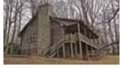
1.8 acres! Rustic Charm! $174,900