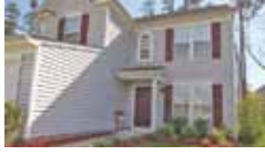
Looks like HGTV! 3BR! A DEAL! $109,900