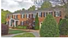
So much space! Huge bonus or media! 5BR! Vaulted sunroom! Private yard! $374,900