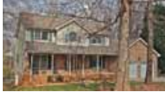
Potential Short Sale! Deerfield! 2nd Living Quarters! $205,000