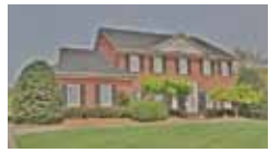
Walk to GCC! Private backyard! 5BR! $449,900