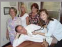
Belmont Chiropractic Staff

Personal Injury/Auto Accident Cases Workman's Compensation Sports Injury Children's Chiropractic Care Most Insurance Accepted