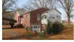
Commercial! New Hope Rd! $225,000