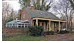
Classic beauty! 3BR! Great sunroom! Garage apt! $249,900