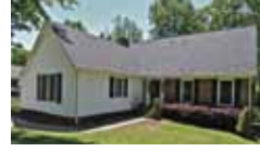
Gardner Park! Master down! So much space! So much style! $149,900