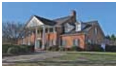
Live large! 5BR! 2 Bonus rms! Walk to GCC! $595,000!