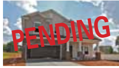
ALL 6 SOLD! RYLAND HOMES AMERICA'S HOME BUYERS