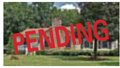
Belmont! Vaulted 3BR! $139,900