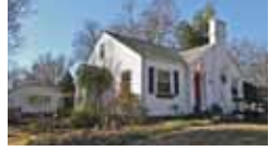
York Chester Charm! Hardwoods! Updated! $89,900