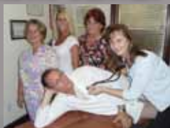
Belmont Chiropractic Staff

Personal Injury/Auto Accident Cases Workman's Compensation Sports Injury Children's Chiropractic Care Most Insurance Accepted