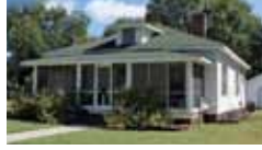
Mt Holly Business zoned! $129,900