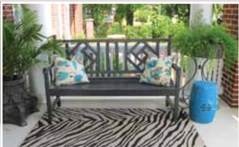
Handcrafted Chippendale style bench painted cottage black. This pattern was faithfully copied from a Charleston bench by a master craftsman and can be ordered at Blythe Gallery with your choice of paint color.)