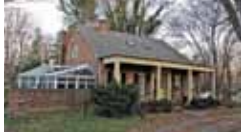
Classic beauty! 3BR! $249,900