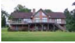
Beautiful pond! Lake Wylie access! Open & spacious! $375,000