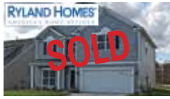
Only 1 left! Brand NEW! USDA eligible! Buyer incentives! $186,279