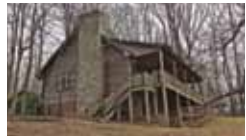
1.8 acres! Rustic Charm! $174,900