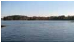
Mtn. Island Lake waterfront! $149,900