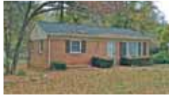
Catawba Hts! Large yard! $57,500