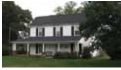
Vintage! 2nd Liv Qtrs! $179,900