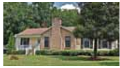
Belmont! Vaulted 3BR! $139,900