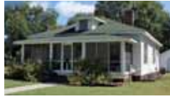
Mt Holly Business zoned! $129,900