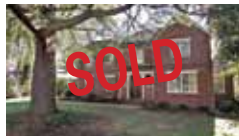
Gastonia elegance! $189,900