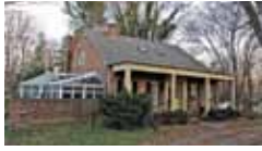
Classic beauty! 3BR! $249,900