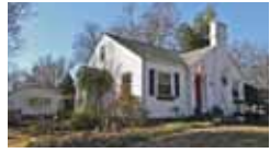
York Chester Charm! Hardwoods! Updated! $89,900