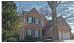
Stately Colony Woods! $199,900