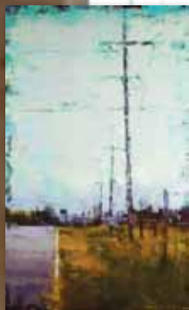
High-Country Poles Oil/Encaustic - 36" x 60"

Want to find out more, commission a piece, or take lessons? art@Butlerstudio.org • www.butlerstudio.org • 704-470-5245