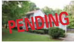
Mt Holly! 3BR close to EGHS! $139,900