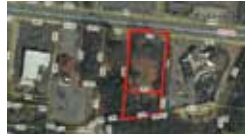
Commercial! New Hope Rd! $225,000