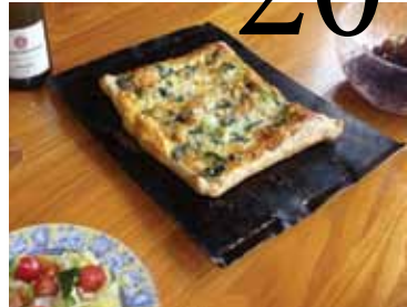
20 THE GLENN'S IMPROVISE LUNCH