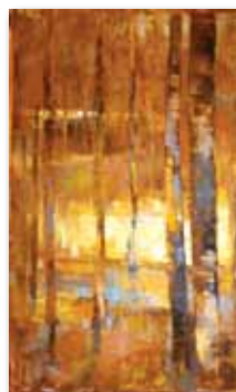
Hardwood Splendor Oil/Encaustic - 36" x 60"