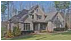
Misty Waters! Deeded boat slip! Over 5000 sq ft! $774,900