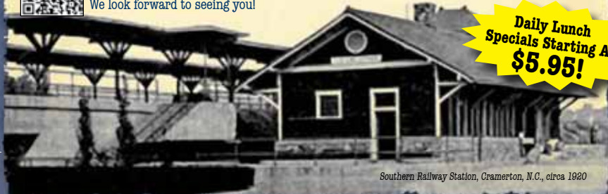
Southern Railway Station, Cramerton, N.C., circa 1920

*Cannot be combined with any other offer. Dine-In only. †One free kids meal with each adult entree purchase. 10 and under. Cannot be combined with any other offer. Dine-In only.